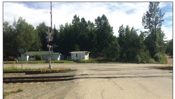
Looking east at the crossing over Willow Station Road.