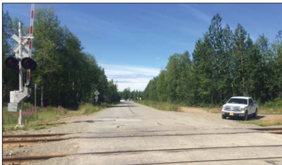
Looking west at the crossing over Willow Station Road.