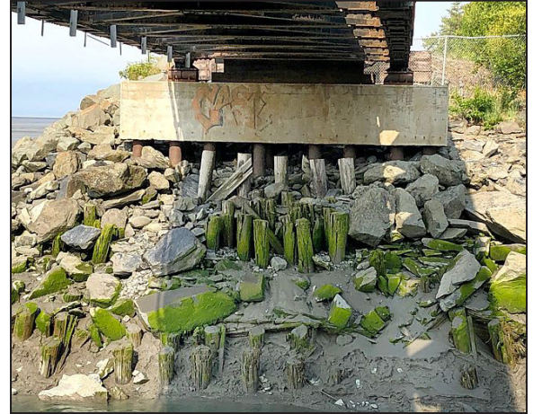
Top Left: A cross section of the proposed 125-foot through-plate girder bridge placed on the existing substructures. Top Right: An existing abutment.