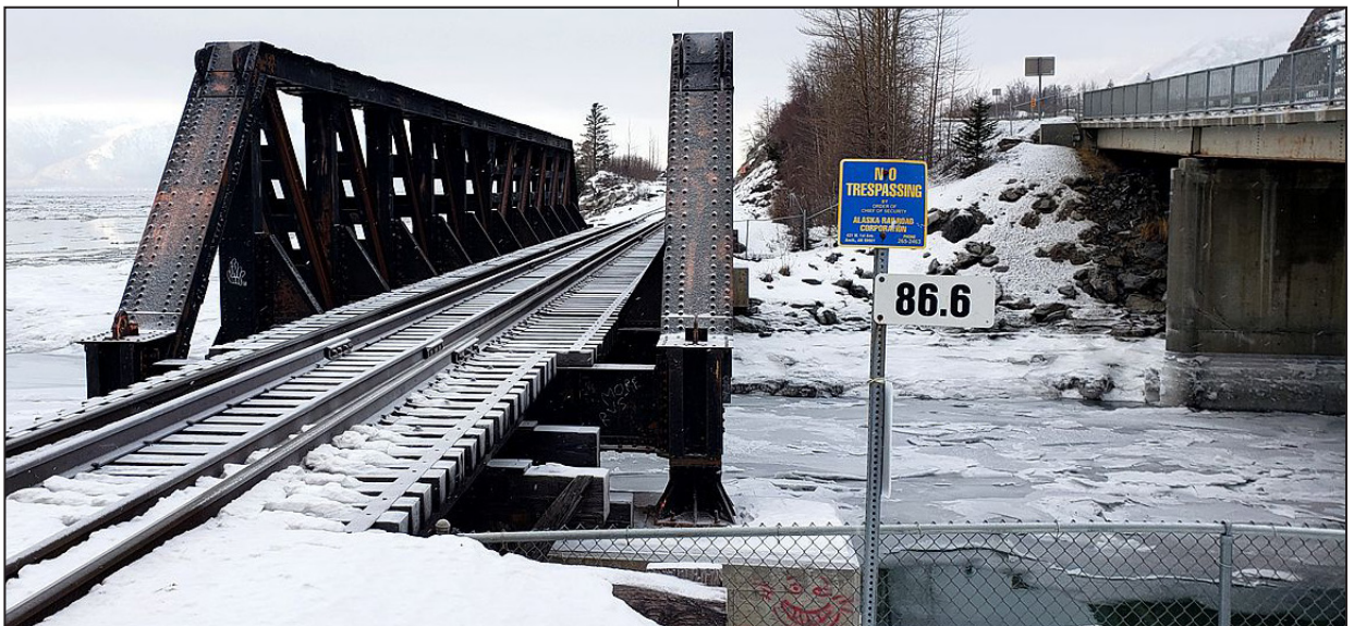
Bridge 86.6 crosses Bird Creek, just south of Anchorage.

The grant is half (50%) funded by the FRA and 50% by the Alaska Railroad to satisfy the matching contribution required by CRISI grants.