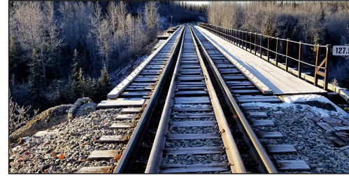
View of top of the bridge at Milepost 127.5, looking south.