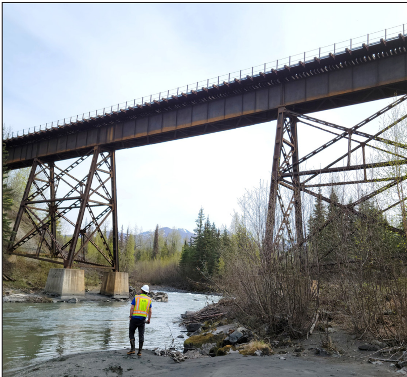
Bridge 127.5 crosses Eagle River north of Anchorage.