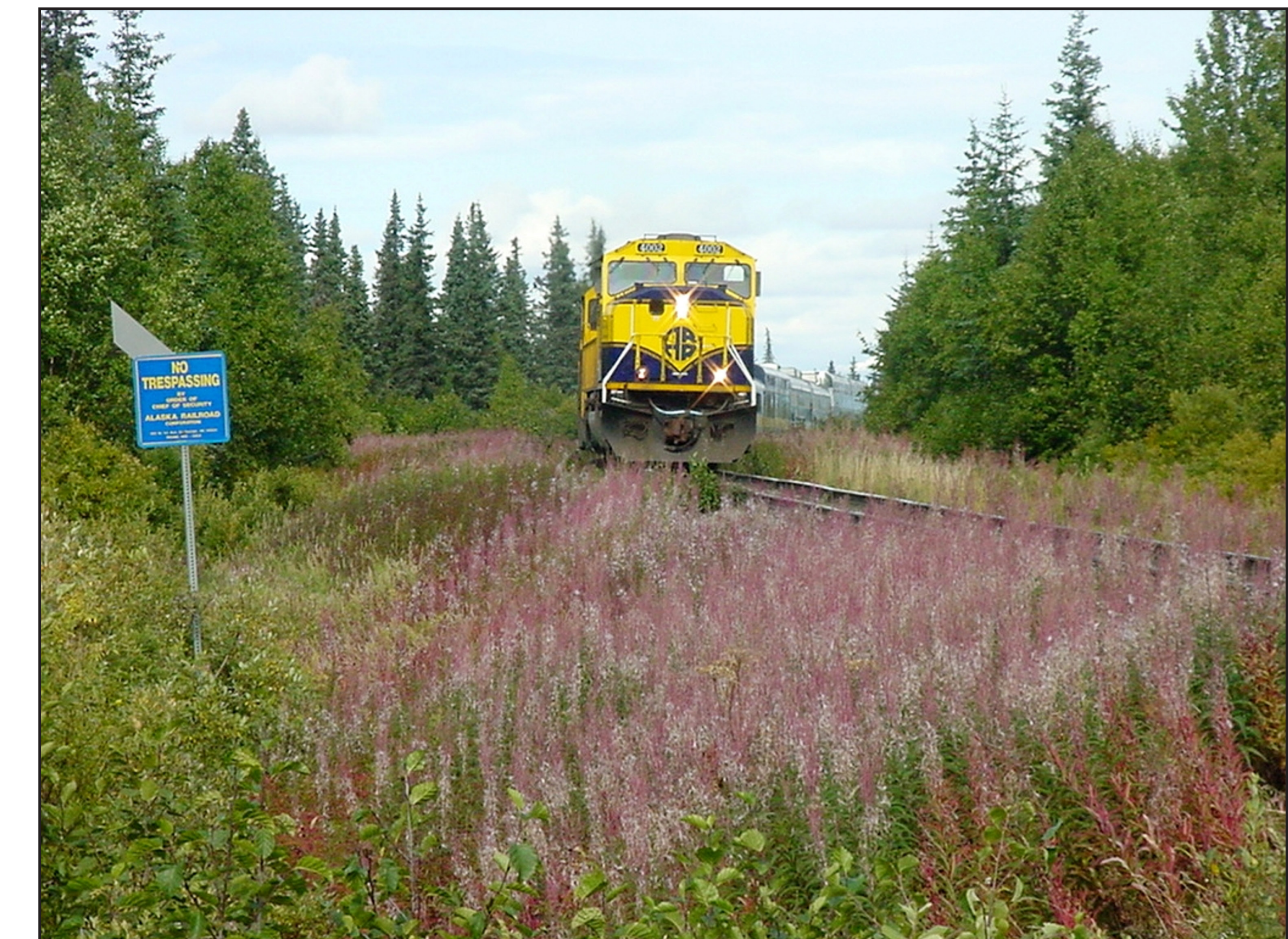
The Federal Railroad Administration has fined ARRC for non-compliance.