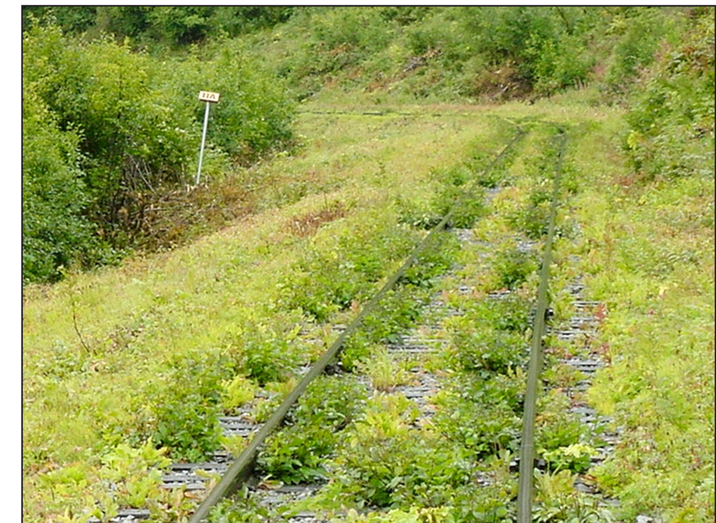
The ARRC right-of-way can provide a vector for the spread of invasive, noxious weeds.