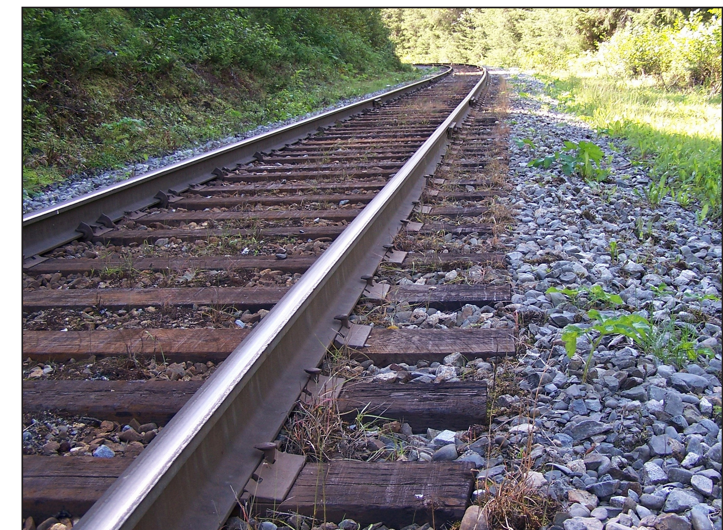
Post herbicide control near Seward. Note the clear distinction at the herbicide control area boundary at the end of the ties indicating that the herbicide does not migrate.

Bottom Line: Vegetation Control = Risk Control