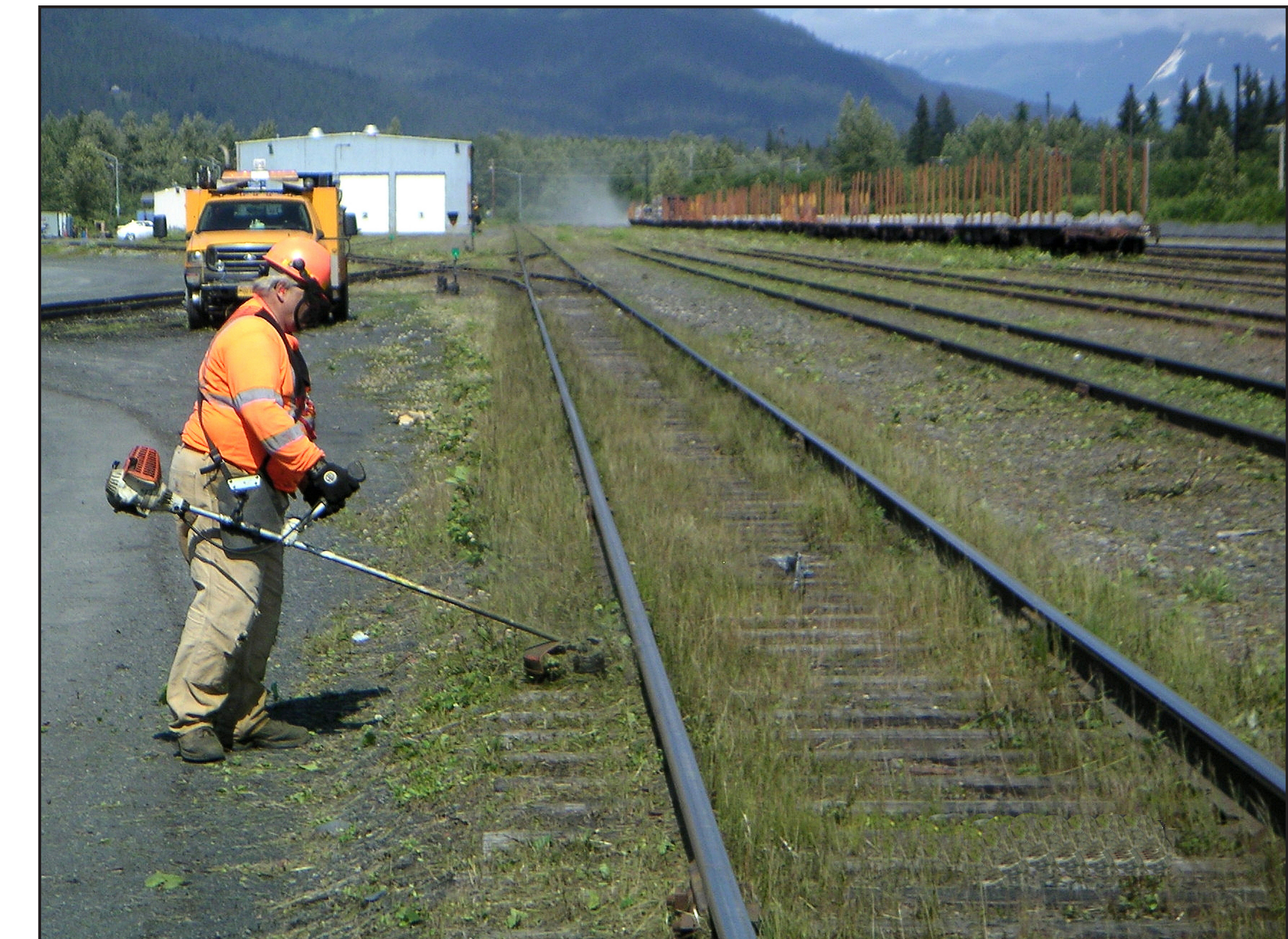
Ineffective mechanical / manual vegetation control in the Seward Yard prior to herbicide application.