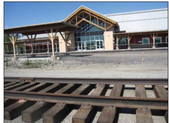
The second track is placed before ballast is poured.