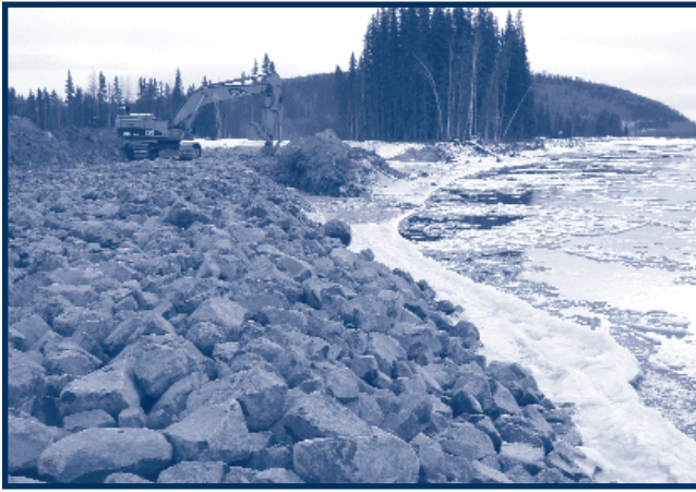
Construction on the levee requires significant rip-rap material from a local source in North Pole.

The work of busy beavers has spurred a remarkable partnership between the Alaska Department of Fish & Game (ADF&G), Salcha Elementary School, Tanana Valley Watershed Association (TVWA) and the Alaska Railroad.