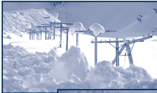
Above: Snow reaches the top of old telephone poles near Grandview

When a moose is killed on the track, train crews do their best to ensure that the animal doesn't go to waste. The Alaska Railroad maintains an agreement with the Alaska Department of Corrections, whereby the Point MacKenzie Correctional Center is called to dispatch crews who recover moose hit on the track between Wasilla and Talkeetna. Inmates process the meat into burger, which is donated to the Food Bank of Alaska for distribution to needy Alaskans. On the north end of the track, ARRC notifies Fish & Game or Public Safety officials, who in turn notify a list of charitable organizations that recover the moose for the benefit of Alaskans in need. ●