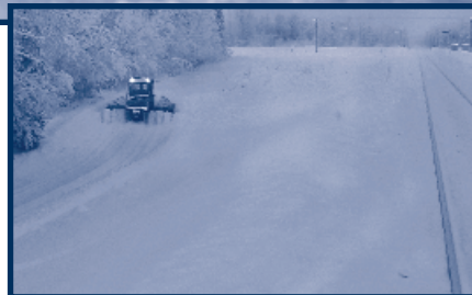
Right: Track maintenance crews create alternate moose trails away from the tracks.