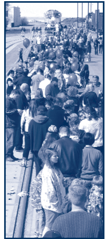
Free train rides are a bit.

For more information, please contact Stephenie Wheeler by calling (907) 265-2671 or email wheelers@akrr.com . ●