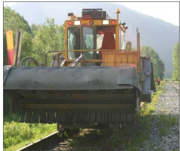
Above top: A ballast regulator is equipped with an arm to scrape vegetation along side the track bed. Above and right: The ballast regulator's bristles are normally covered with rubber, which is stripped to expose the wire when the equipment is used for vegetation management.