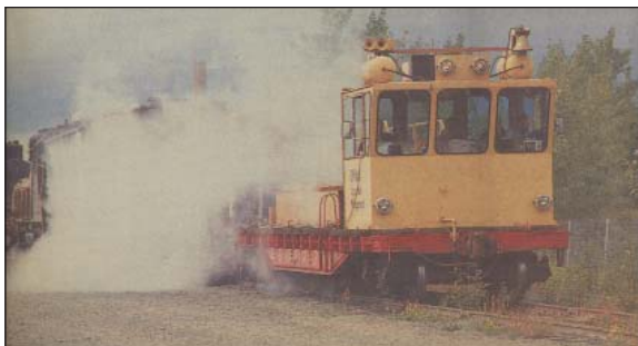
The CP Steam Machine control car.