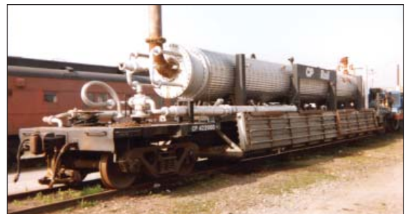
The CP Steam Machine steam / boiler car.